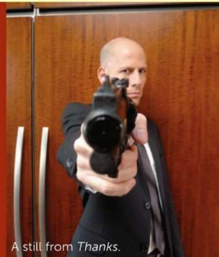
A still from Thanks .

► Seven Brides for Seven Brothers , the 1954 classic filmed in Arizona, will be presented by Turner Classic Movie's Robert Osborne and one of the film's stars, Jane Powell.