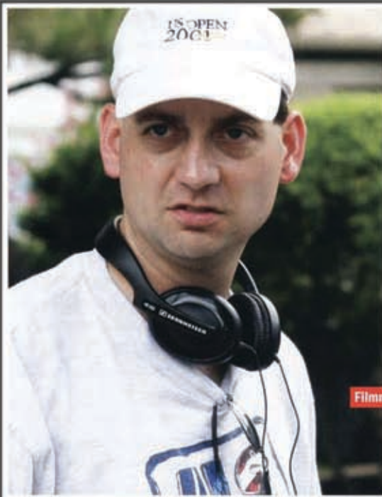
Filmmaker Tommy Stovall